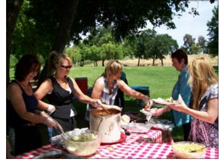
Bill's Chuckwagon serves lunch